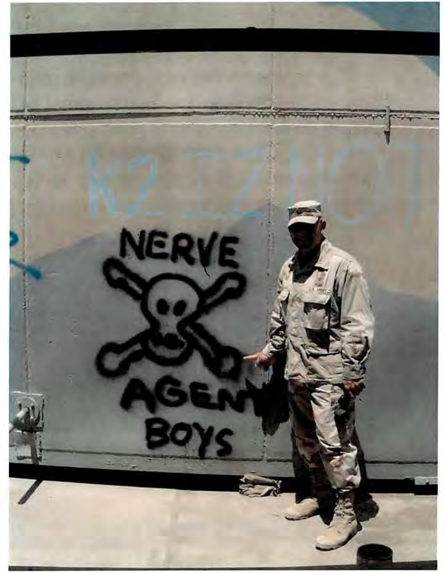
B-2 Figure B-2. (U) (S//NF) HAS 14 Markings -5 July 02

These photos illustrate the risk communication challenge faced by the command at Stronghold Freedom to explain the false positive readings for Chemical Weapons in these structures.