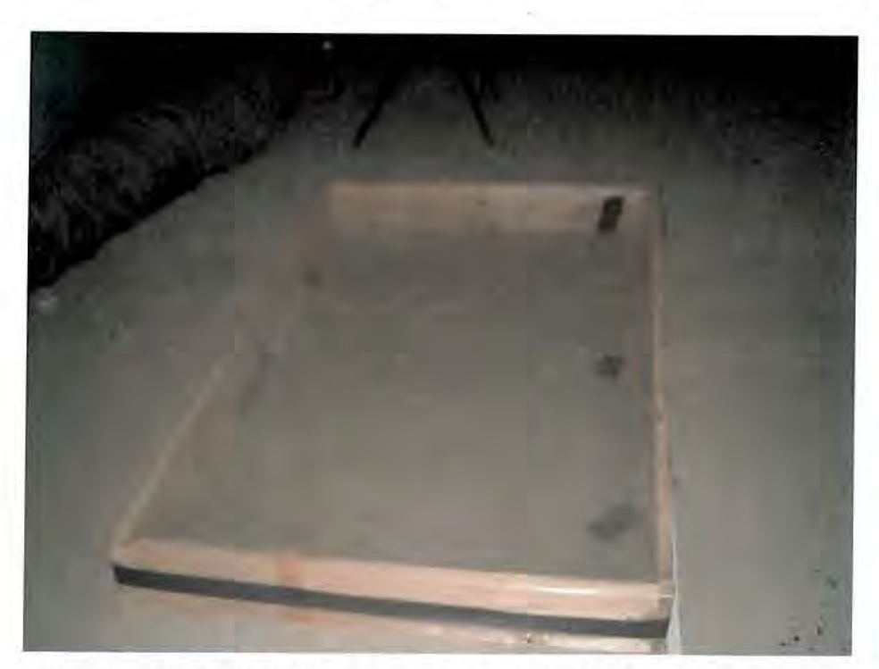
Figure B-3. (U) (S//NF) Typical TEU box used to "trap chemical vapors" from the concrete pad in the floor headspace in HAS 14. These were in shaded hangars and concrete pad temperature was cool to the touch. Presumptive blister agent detects were possibly a relic from treated wood (chromated copper arsenate) that might have been used in the construction of this box.

(U) (S//NF) Field Final Report, Environmental Assessment – Hardened Aircraft Shelters, Stronghold Freedom, Karshi-Khanabad Airfield, Uzbekistan, 6 June – 20 July 2002