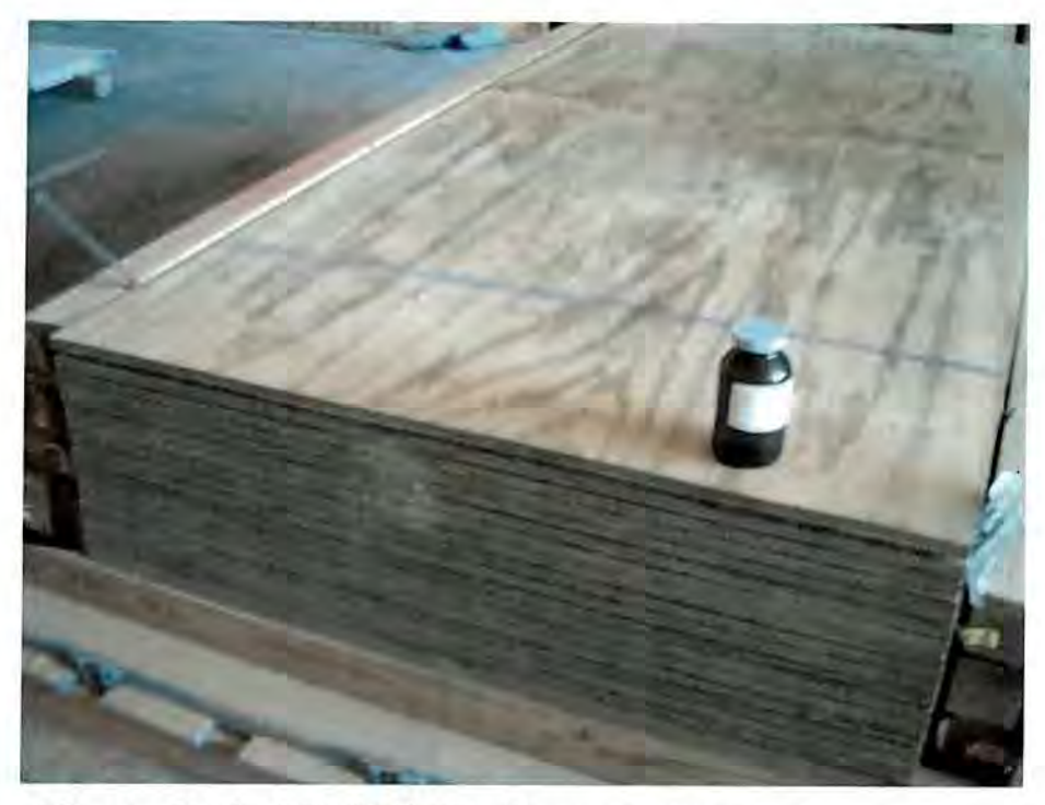
Figure B-4. (U) (S//NF)-Osmose pressure treated plywood (treated with Chromated Copper Arsenate) that was sampled in HAS 15. Bulk samples of plywood and sawdust were collected from this source. A wipe was also collected from this stack of plywood (on side).