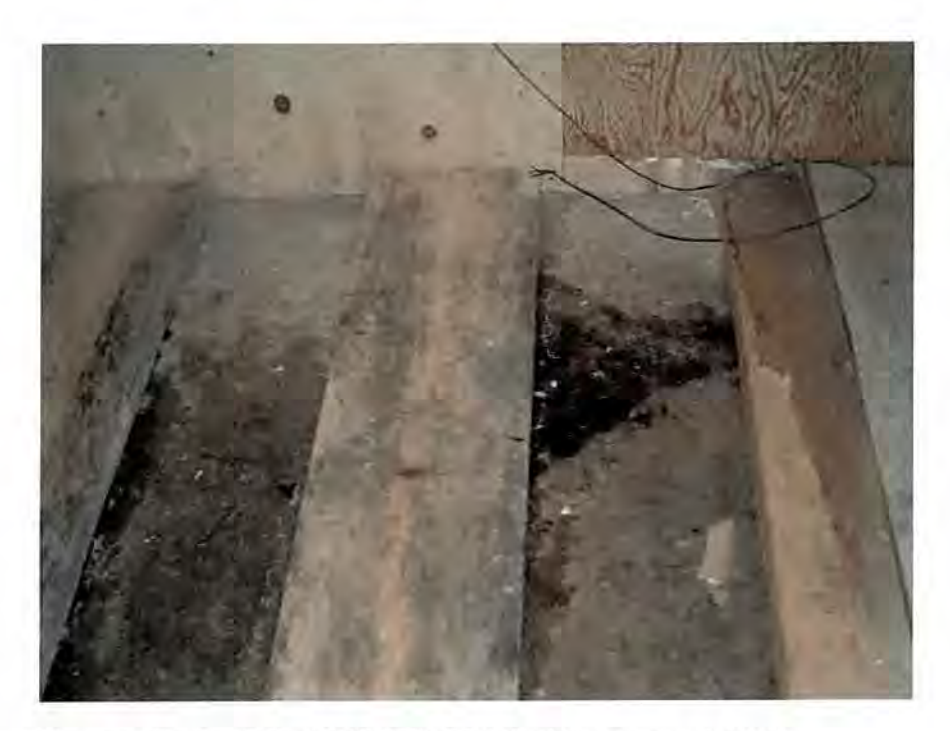
Figure B-5. (U) (S//NF)-HAS 17. Petroleum stain on concrete pad in rear of TOC. This is area where original sampling was performed in early June 2002 and false CW positives were generated by TEU. CHPPM-EUR also collected a Tenax air sample from the breathing zone in this general area; detected low levels of fuel related compounds. Dark "stain" in middle right is substance similar to driveway crack sealant (tar compound).

(U) (S//NF)-Field Final Report, Environmental Assessment – Hardened Aircraft Shelters, Stronghold Freedom, Karshi-Khanabad Airfield, Uzbekistan, 6 June – 20 July 2002