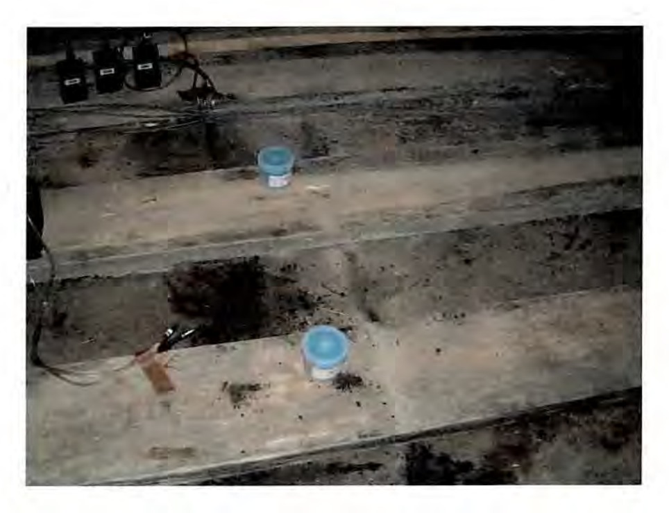
Figure B-6. (U) (S//NF)-HAS 17. Location of soil samples and cracks in concrete pad where soil was collected for samples 17-S-1 and 17-S-2. Photo also shows collocated air sampling pumps (locations 17A and 17B) placed at this location to capture air contaminants from this source. Soil was cleaned out of cracks to fill the two sample containers.